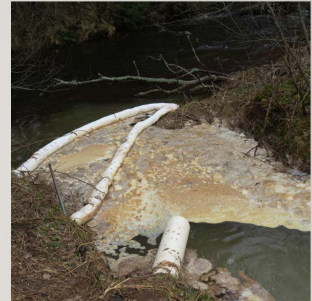
Hatchery discharge pipe on Cardigan River,, Prince Edward Island.