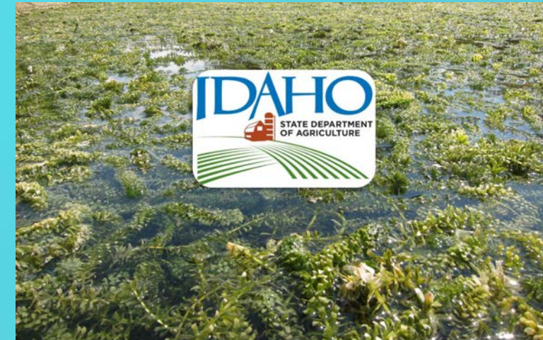
Idaho Waterways Survey A Standard Operating Procedure for Aquatic Plants & Invasive Species