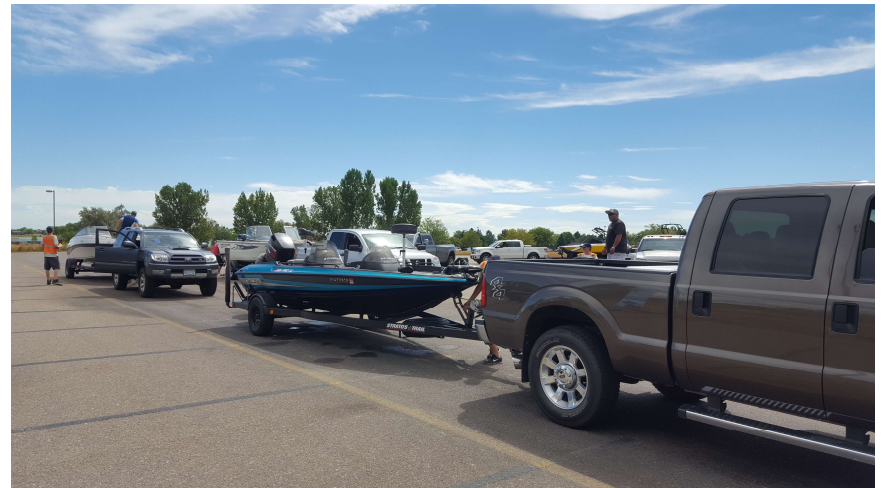
Pg. 155 - Partnerships

LIMITATION.—The Secretaries shall not prohibit access to Federal land and water for vessels under this subsection in the absence of an inspector.