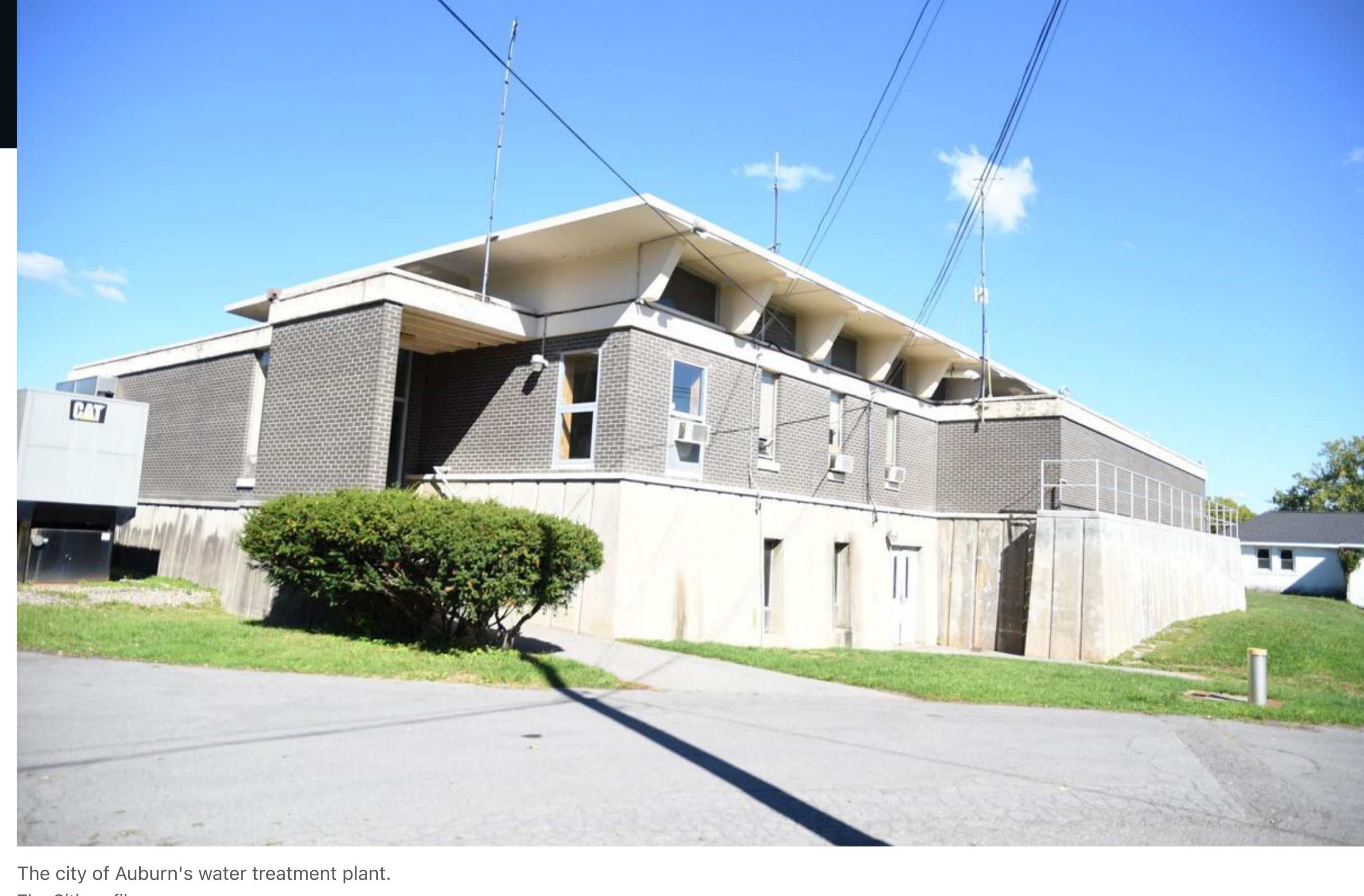
The city of Auburn's water treatment plant.

Kelly Rocheleau Aug 7, 2023 Updated 12 hrs ago 0