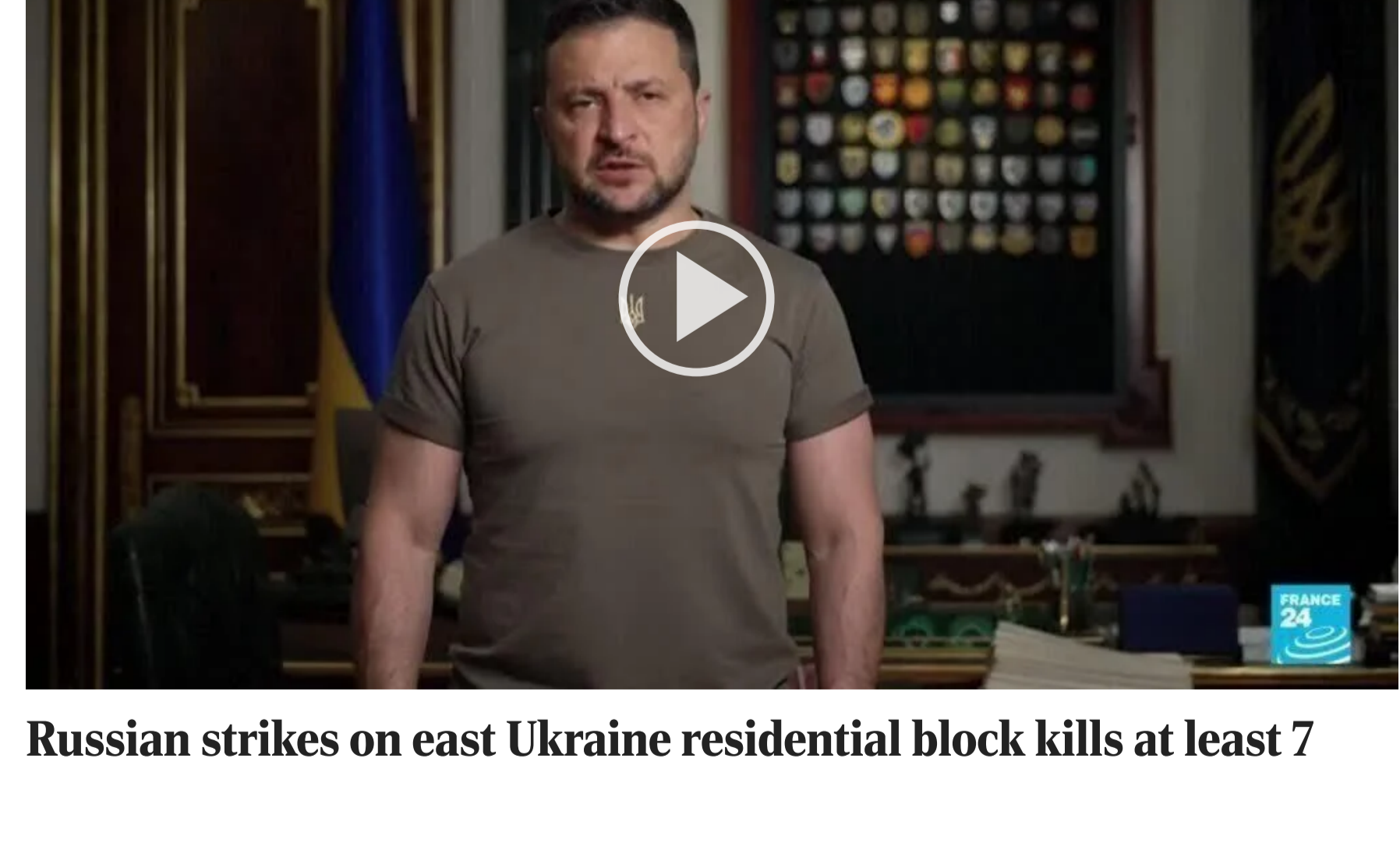
Russian strikes on east Ukraine residential block kills at least 7